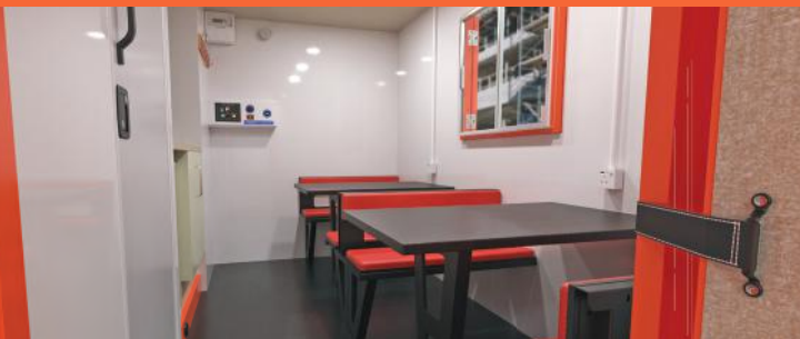
SPACIOUS WELFARE SEATING AREA