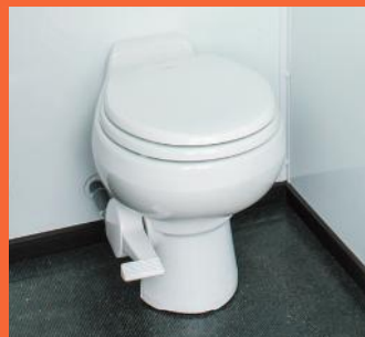
LOW FLUSH ECO TOILET